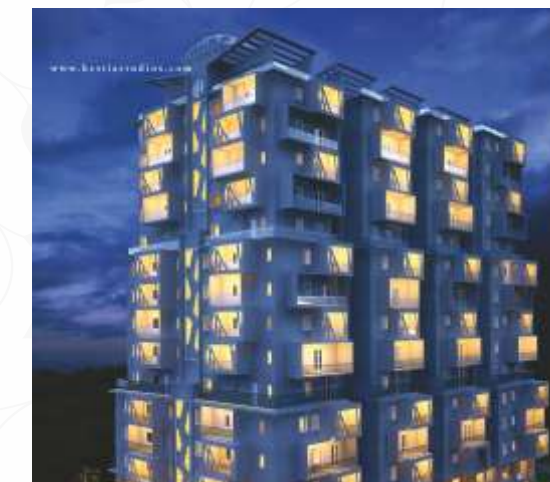
Jains Sadguru Heights, Madinaguda.