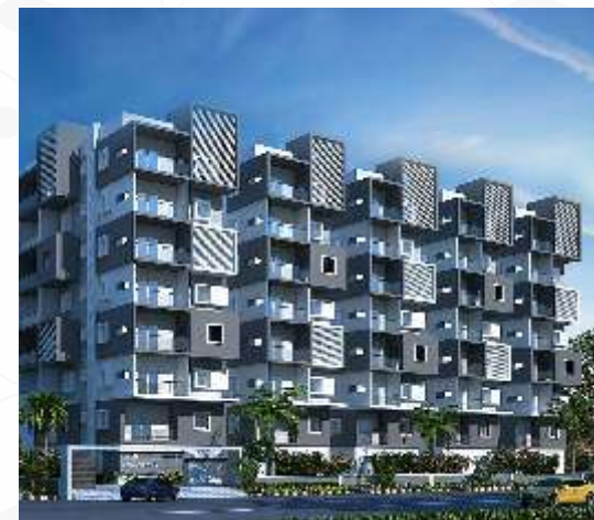
Jains Ravi-Gayathri Heights, Shilparamam.