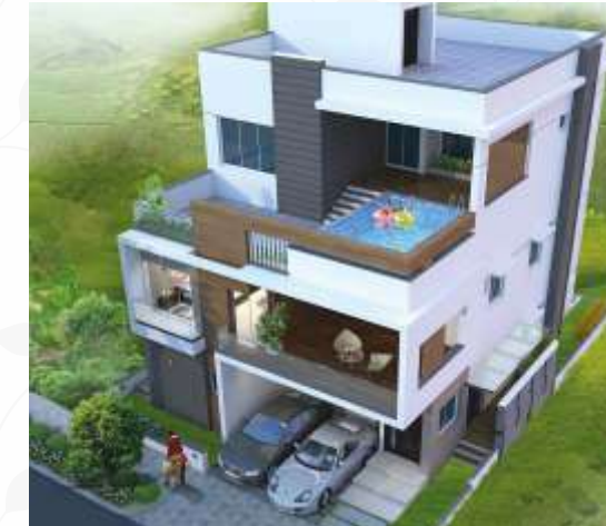
Jains Four Seasons, Kokapet.