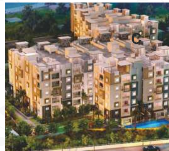
Jains Srikar Auroville, Hi-Tech City.